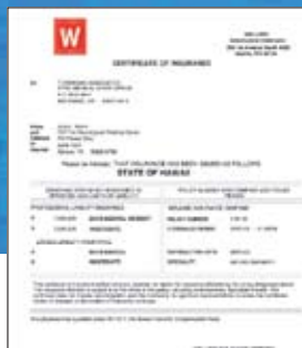
Sample—Certificate of Insurance